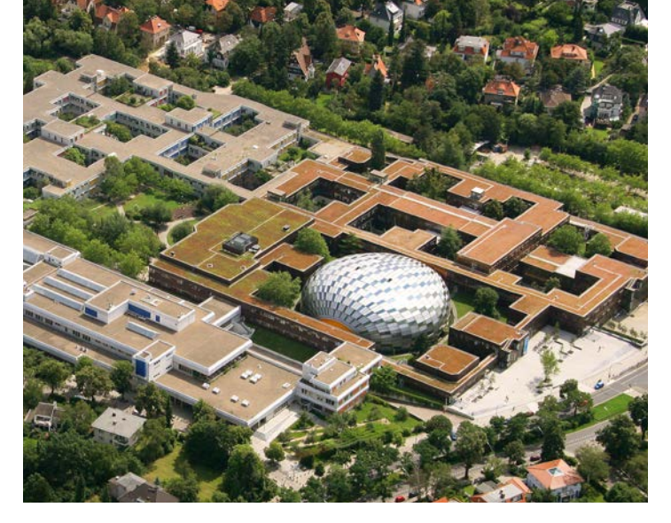
The Philological Library is surrounded by the building complex housing the humanities and social sciences. Designed by Lord Norman Foster, the library building has been the recipient of many awards since its opening in 2005.