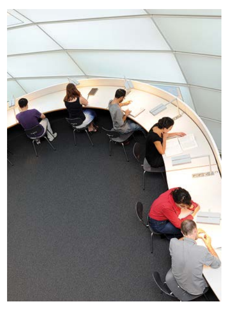
The Philological Library offers excellent study facilities for students and faculty. The library consists of 14 sub-libraries with 750,000 printed volumes.

from the very beginning: the first exchange students went to Stanford University, U.S.A., in 1949. Currently, Freie Universität participates in the programs and Erasmus+ Promos by the Deutscher Akademischer Austauschdienst and also maintains agreements with over 80 universities for direct exchange. Junior researchers are supported in structured Ph.D. programs under the auspices of Dahlem Research School. Many well-known personalities from politics and society studied at Freie Universität, including the