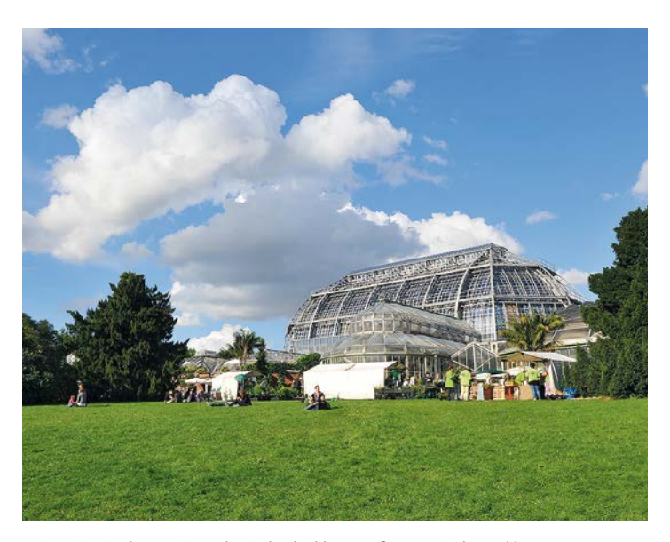
Freie Universität's Botanic Garden is the third largest of its type in the world. It attracts 300,000 scientists and visitors annually