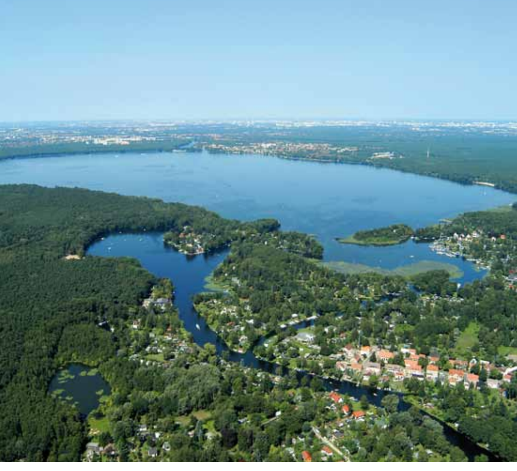
Berlin's great wealth of urban green space helps provide a high quality of life.