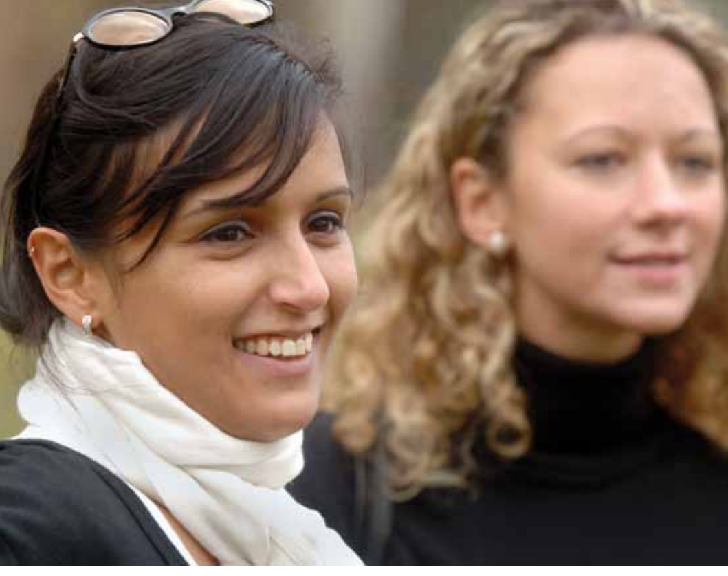
According to statistics from the German Academic Exchange Service (DAAD), Freie Universität is by far the most popular destination in Germany for students from abroad.