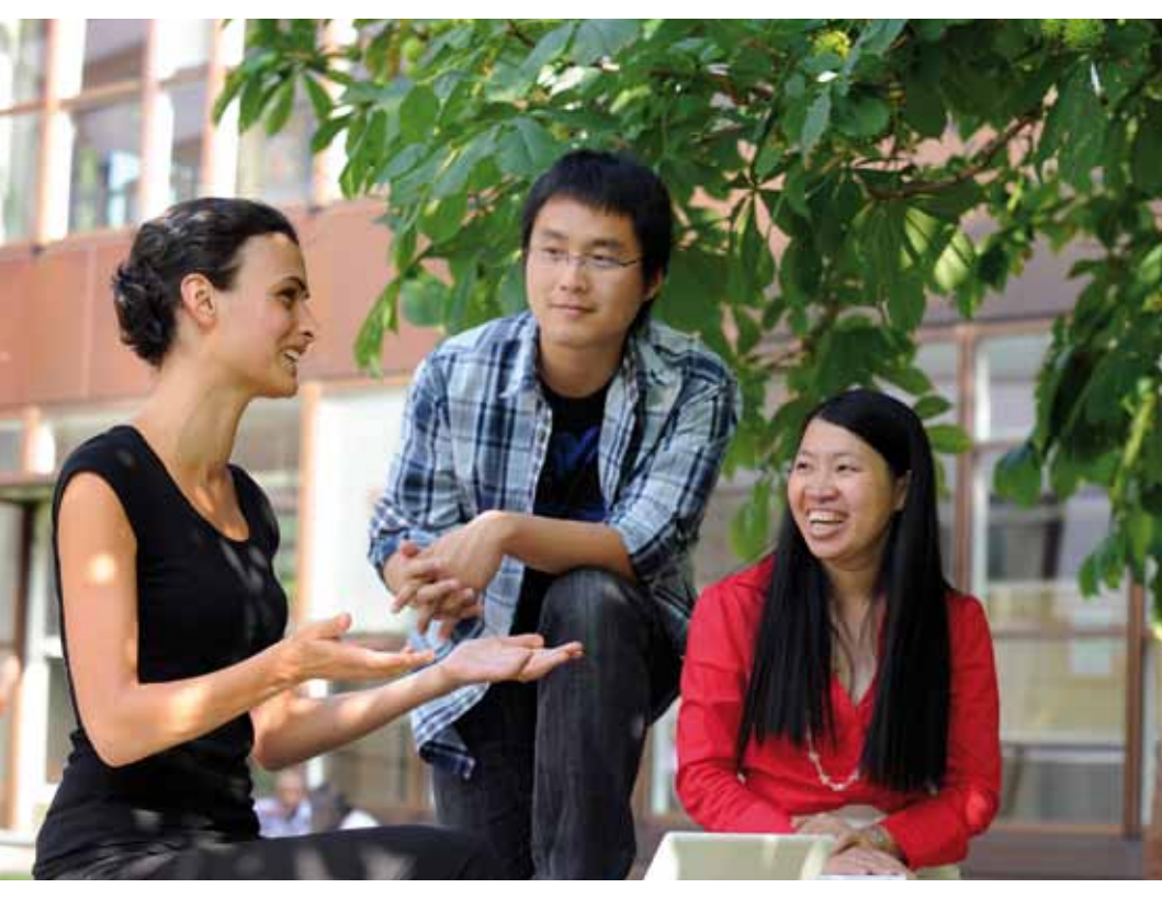
Roughly 28,500 young people study at Freie Universität Berlin.