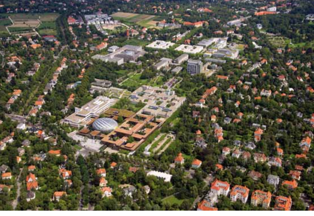
The Philological Library is surrounded by the building complex housing the humanities and social sciences.

The Dahlem campus hosts 12 of the university's 15 departments and central institutes, more than 20 libraries, various student cafes and dining halls – including Germany's first vegetarian university dining hall, university sport facilities, and the Botanic Garden. The campus is surrounded by wonderful green gardens and lakes. Some of Freie Universität's institutes are located in the nearby districts Düppel and Lankwitz.