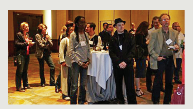
GSA Conference Participants at DAAD Reception in 2014